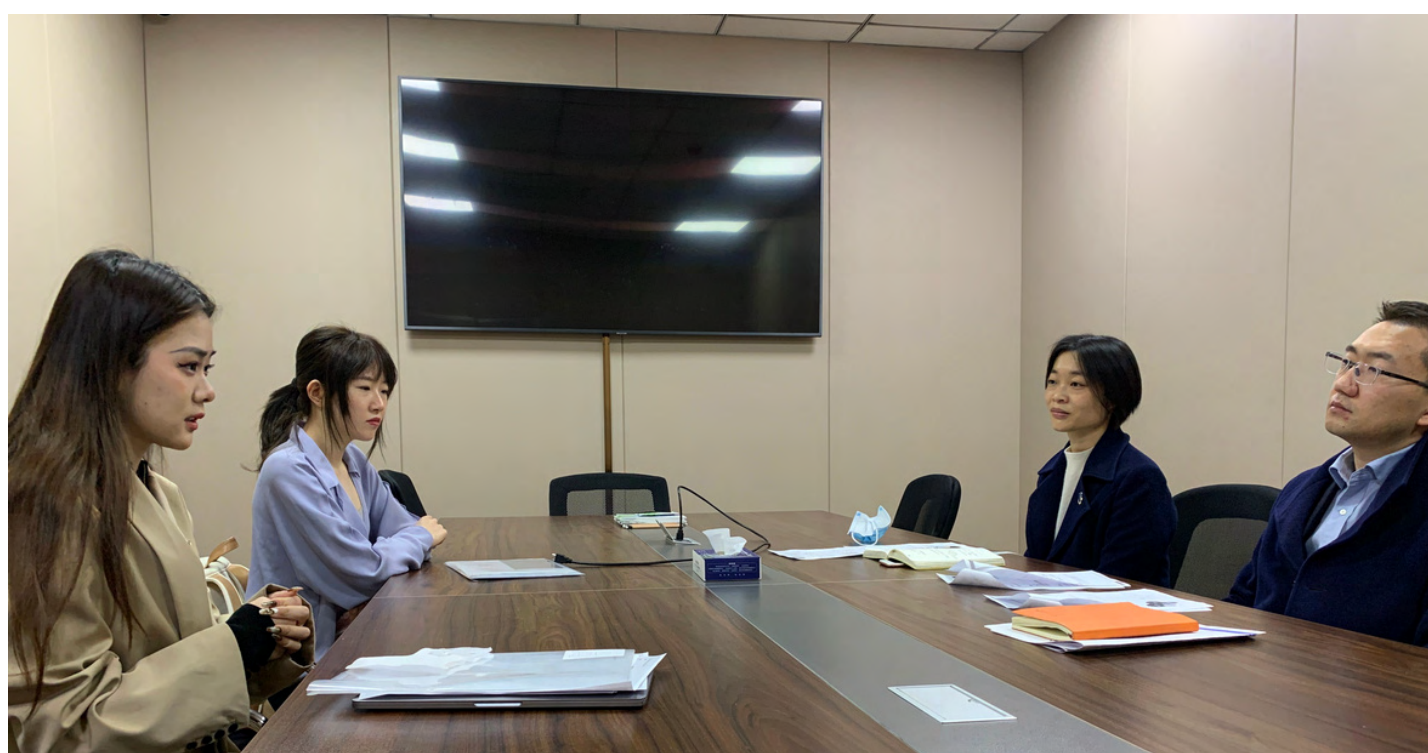
Students being interviewed at Aidi Eye Hospital ("AAA " Grade)