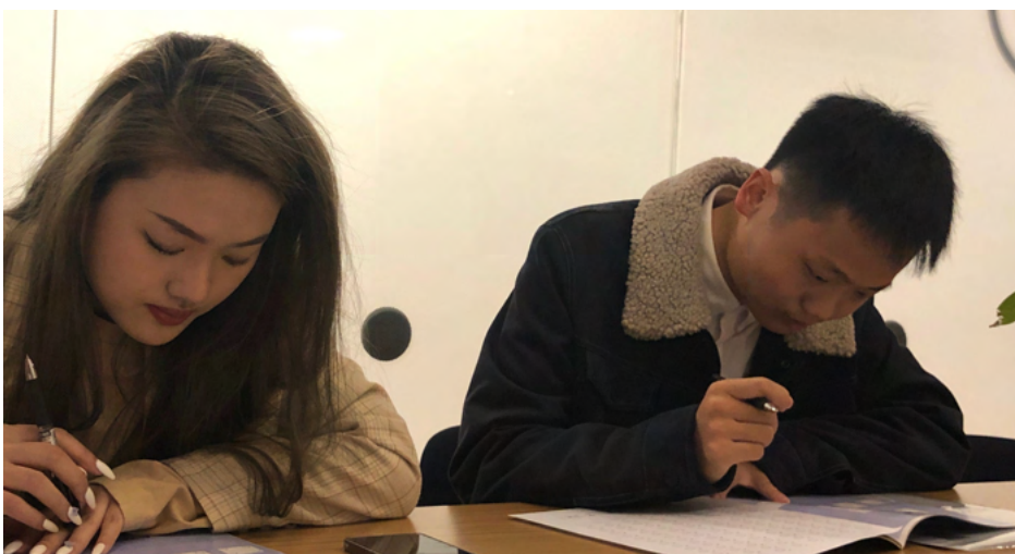
Students doing assessment at Cegos