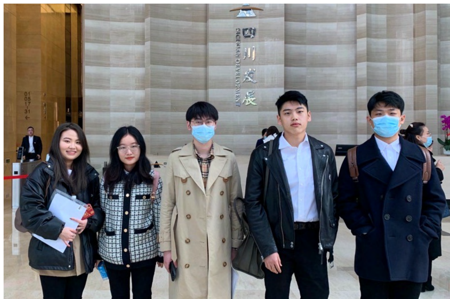
Students took photos at Sichuan Development Holding Co., LTD.