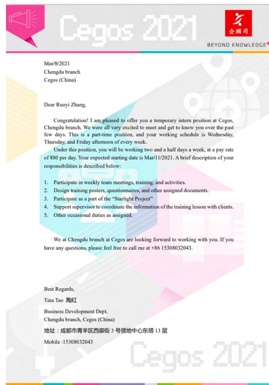
Students got an offer letter from Cegos, a corporate training center