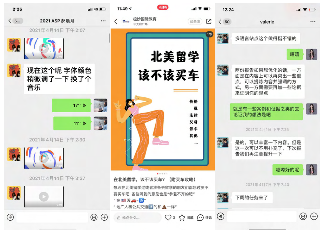
Three online internship students communicating with their supervisor through WeChat (at Sunarliving and G-MEO)